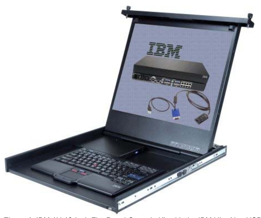
Figure 1. IBM 1U 19-inch Flat Panel Console Kit with the IBM UltraNav USB US English keyboard

These kits include either a 17" or 19" LCD display and accept an UltraNav keyboard available in 29 languages (the keyboard must be ordered separately). The 19-inch kit also includes as standard a multi-burner drive and USB port for additional convenience.